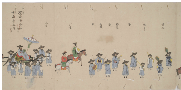
“Illustration of Korean Ship Entering Port and Procession of Korean Envoy of Court Translators”

Exhibition of illustrations, records, and historical documents from the Edo period concerning the “three countries” of Korea, Ryukyu, and Ezo, with which Japan has had a long history of close relations due to its geographical proximity. We shall examine the relations that Japan maintained with these neighboring countries, as well as its internal relations, after the establishment of a unified government and under a unique diplomatic policy of national isolation which began from the first half of the 17th century.