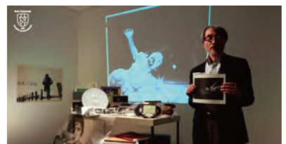
Hijikata Tatsumi archive